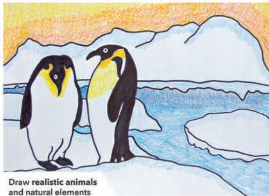
Draw realistic animals and natural elements