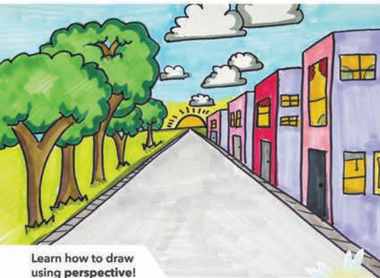
Learn how to draw using perspective!