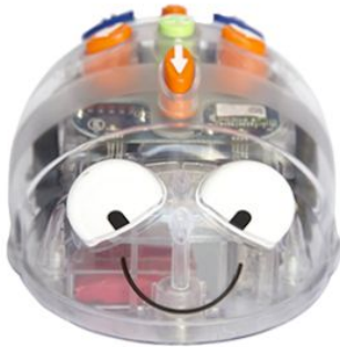
Blue Bots Course