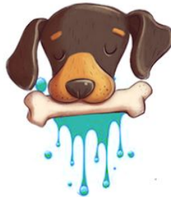
Dog Slobber Slime